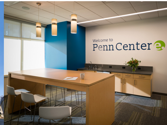
400 PENN CENTER BLVD, PITTSBURGH PA 15235